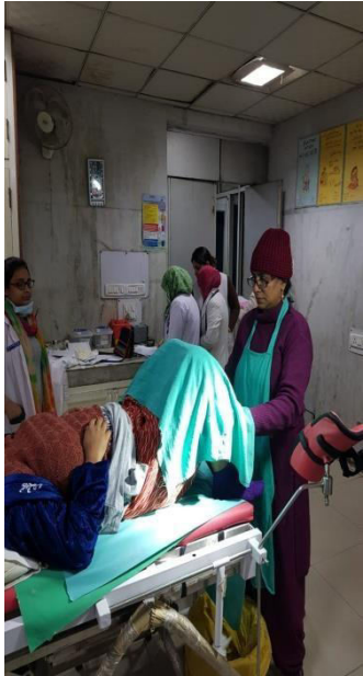
Photographs of the Department/Departmental activity: